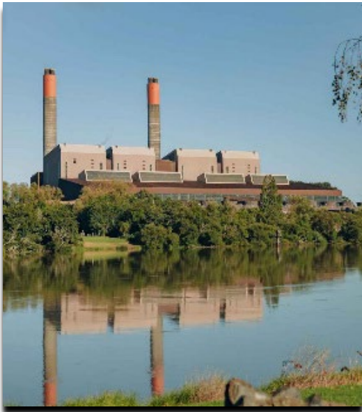
For those interested in pop culture, the station may look familiar — it was digitally transformed into the fictional “Chuglass Potato Chips” factory in The Minecraft Movie.

Travel by coach to Genesis Energy’s Huntly Power Station. The visit will begin with a welcome and short presentation followed by a guided site tour. During the visit, you’ll see key parts of the facility and learn about how it operates, as well as the station’s role in New Zealand’s energy system.